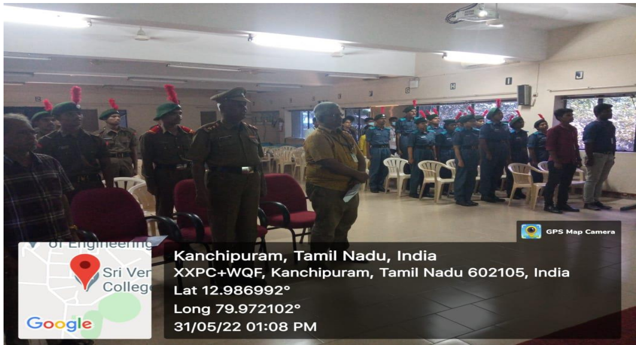
Figure 5. Participants taking pledge on “Not to use Tobacco Products”